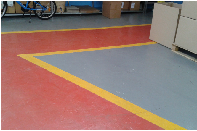
Horizontal signage with excellent grip