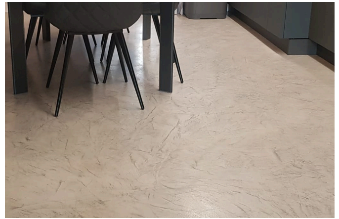
Microcement flooring for offices