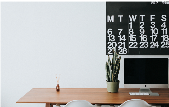
Water-based paints for interiors and exteriors