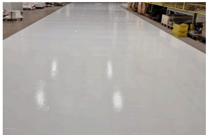
Low-thickness solvent-based system