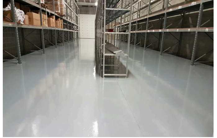
Water-based epoxy resin flooring